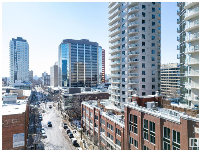
701-10136 104 Street NW, Edmonton, AB