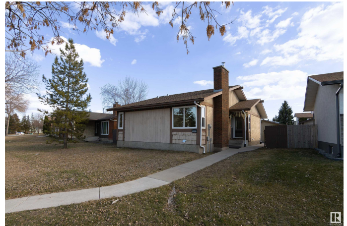
10103 172 Ave NW, Edmonton, AB