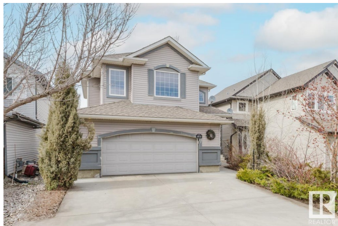
1912 121 St SW, Edmonton, AB